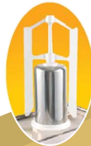
JD 118 MIX25